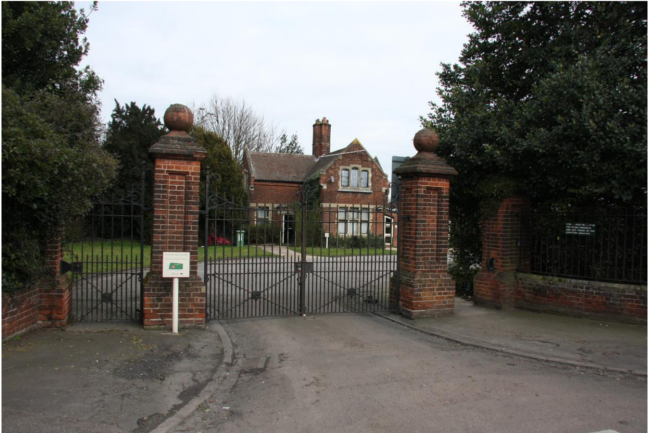
Entrance to Cambridge City Cemetery & Map (below)